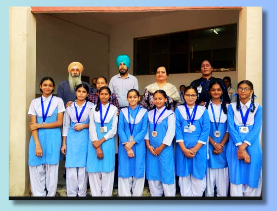
NSPS volleyball shooting team second in state

The Under-17 girls' team of Nankana Sahib Public School, Gill Ludhiana has got second position in level volleyball state shooting tournament held under the banner of Khedan Watan Punjab Diyan. In the state level team, as many as 10 players out of 12 were from NSPS. The final match was played at Amargarh district Malerkotla. Each of these players will get a cash award of rupees 7000.