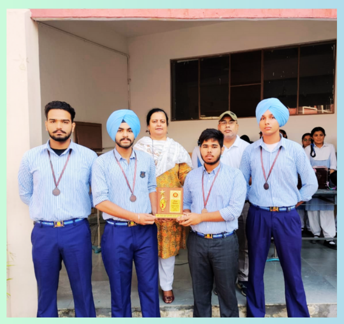
NSPS basketball team third in District

The U-19 Basketball team of Nankana Sahib Public School, Gill Park got overall third position in the Punjab School District Championship. It was held at the Basketball Hall at Guru Nanak stadium. Out of these 3 players have been selected for Punjab School State Basketball championship. The tournament has been organised by the Punjab School Education Department.