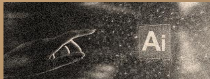
Gurveer Singh Sandhu Class - 11th Sci-B